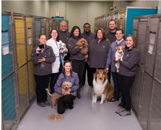
Pet Oasis Staff / The ARK at JFK